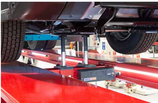
Twin Ram adjustable Jacking Beams fit all platforms.

for any vehicle or equipment and for any Stertil-Koni vehicle lift as required. Although in most cases adapters are not required we do have a comprehensive range. Especially designed for all types of construction and earthmoving vehicles and equipment. As industry specialist, Stertil-Koni can provide advice depending on your requirements. Our exclusive and extensive range of accessories are functionally designed and easy to mount to the lift.