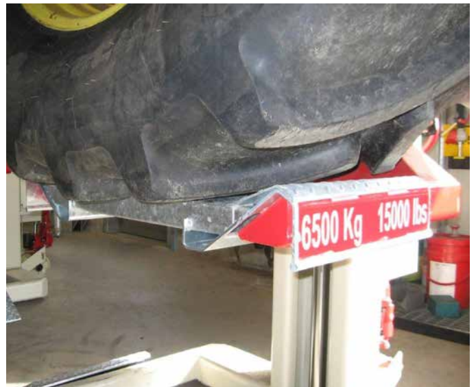
Large Wheel Adapters.