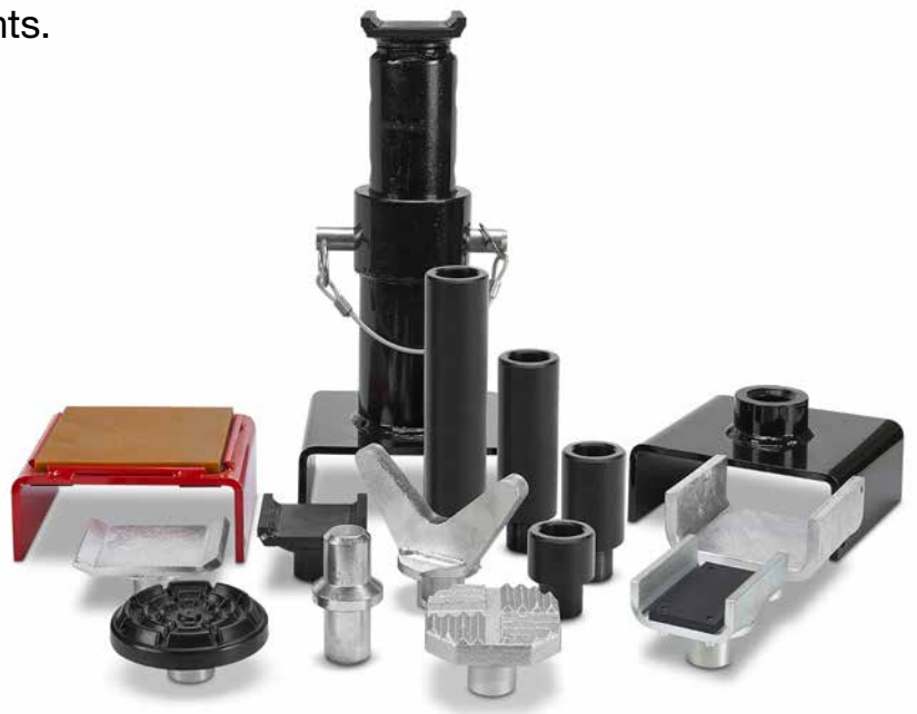
Wide-range of pick-up adapters.