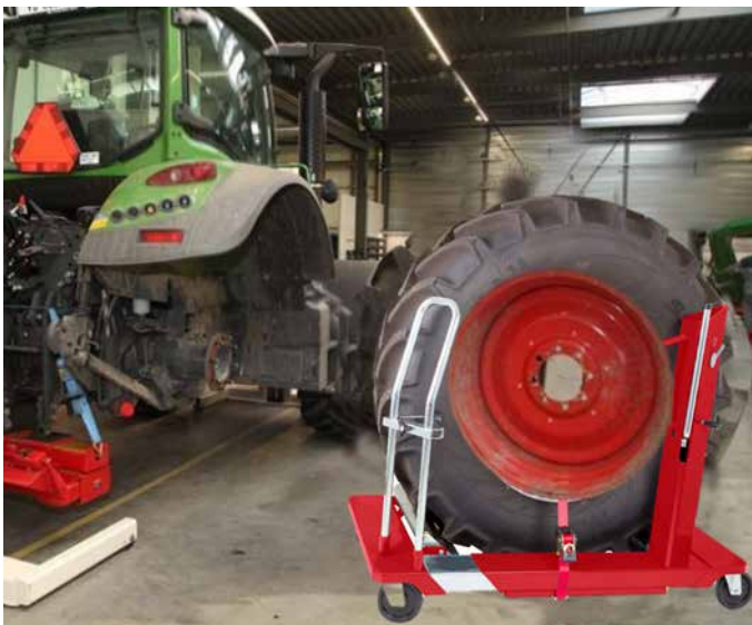
Wheel Dolly for convenient and ergonomic removal of large wheels.