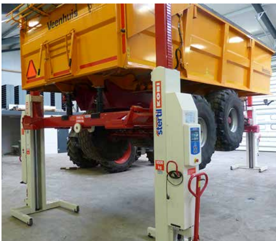
Low-Profile Crossbeam for more accessibility wheel-free maintenance.