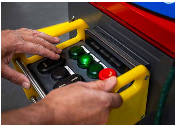
Easy to operate Remote Controls. Controls.