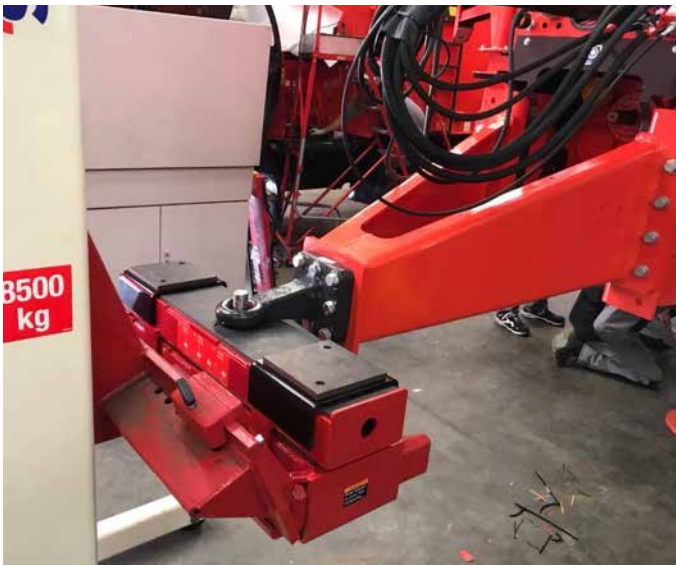
Multi-Purpose Adapters for wheel-free front or rear vehicle lifting with two or three mobile column lifts.