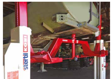
Traverse Kingpin Crossbeam for the safe and stable detachment and independent lifting of a trailer from the unit or cab.