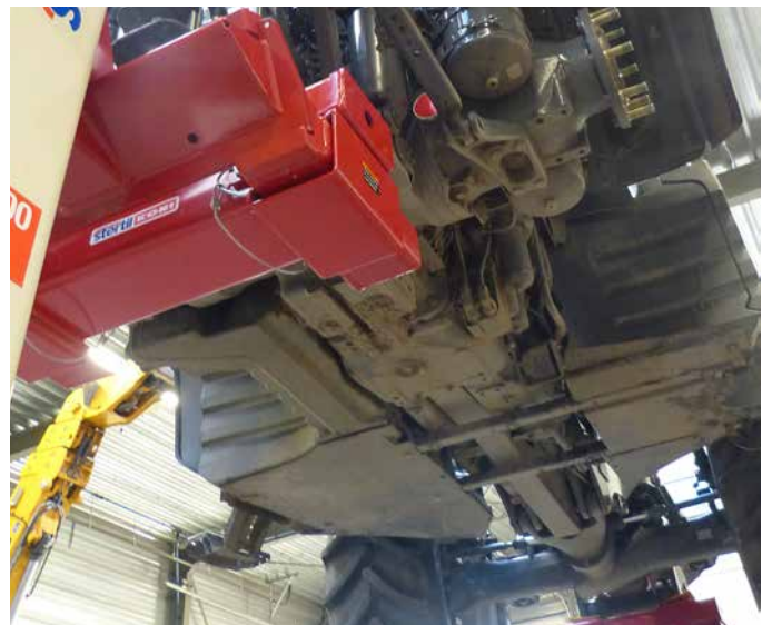
Special Pick-Up Adapters for wheel-free lifting.