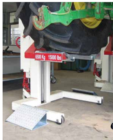
Base Frame and Lifting Fork Extensions for vehicles with recessed wheels.