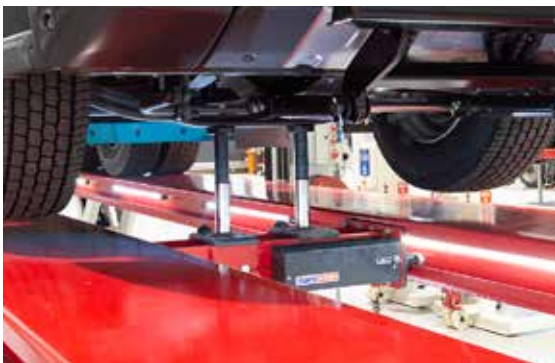
Twin Ram adjustable Jacking Beams fit all platforms.

for any vehicle or equipment and for any Stertil-Koni vehicle lift as required. Although in most cases adapters are not required we do have a comprehensive range. Especially designed for all types of construction and earthmoving vehicles and equipment. As industry specialist, Stertil-Koni can provide advice depending on your requirements. Our exclusive and extensive range of accessories are functionally designed and easy to mount to the lift.