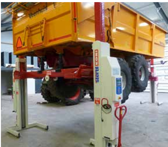
Low-Profile Crossbeam for more accessibility wheel-free maintenance.