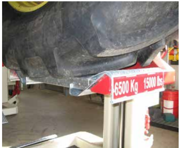
Large Wheel Adapters.