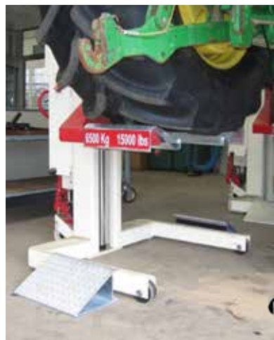
Base Frame and Lifting Fork Extensions for vehicles with recessed wheels.