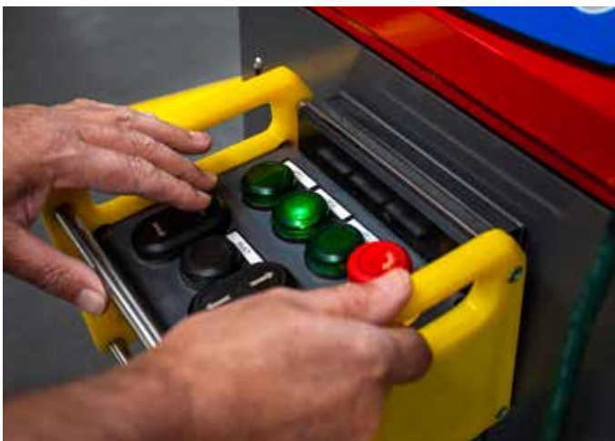
Easy to operate Remote Controls.