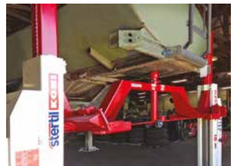
Traverse Kingpin Crossbeam for the safe and stable detachment and independent lifting of a trailer from the unit or cab.