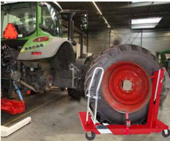
Wheel Dolly for convenient and ergonomic removal of large wheels.