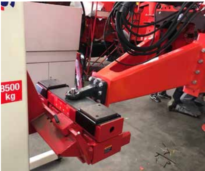
Multi-Purpose Adapters for wheel-free front or rear vehicle lifting with two or three mobile column lifts.